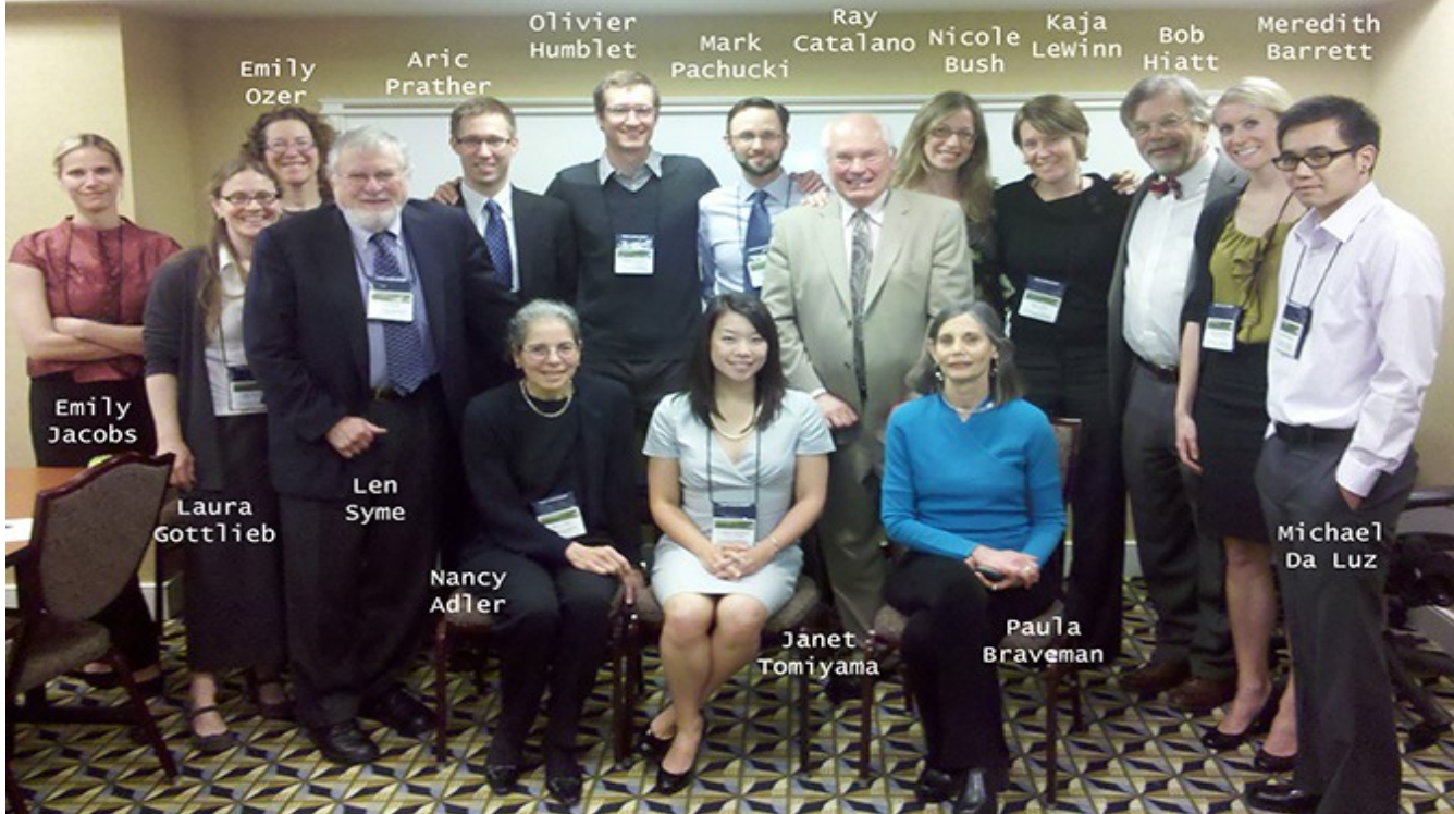
UCSF-UCB Site Breakfast ~ Doubletree Hotel, Bethesda, MD – May 4, 2011