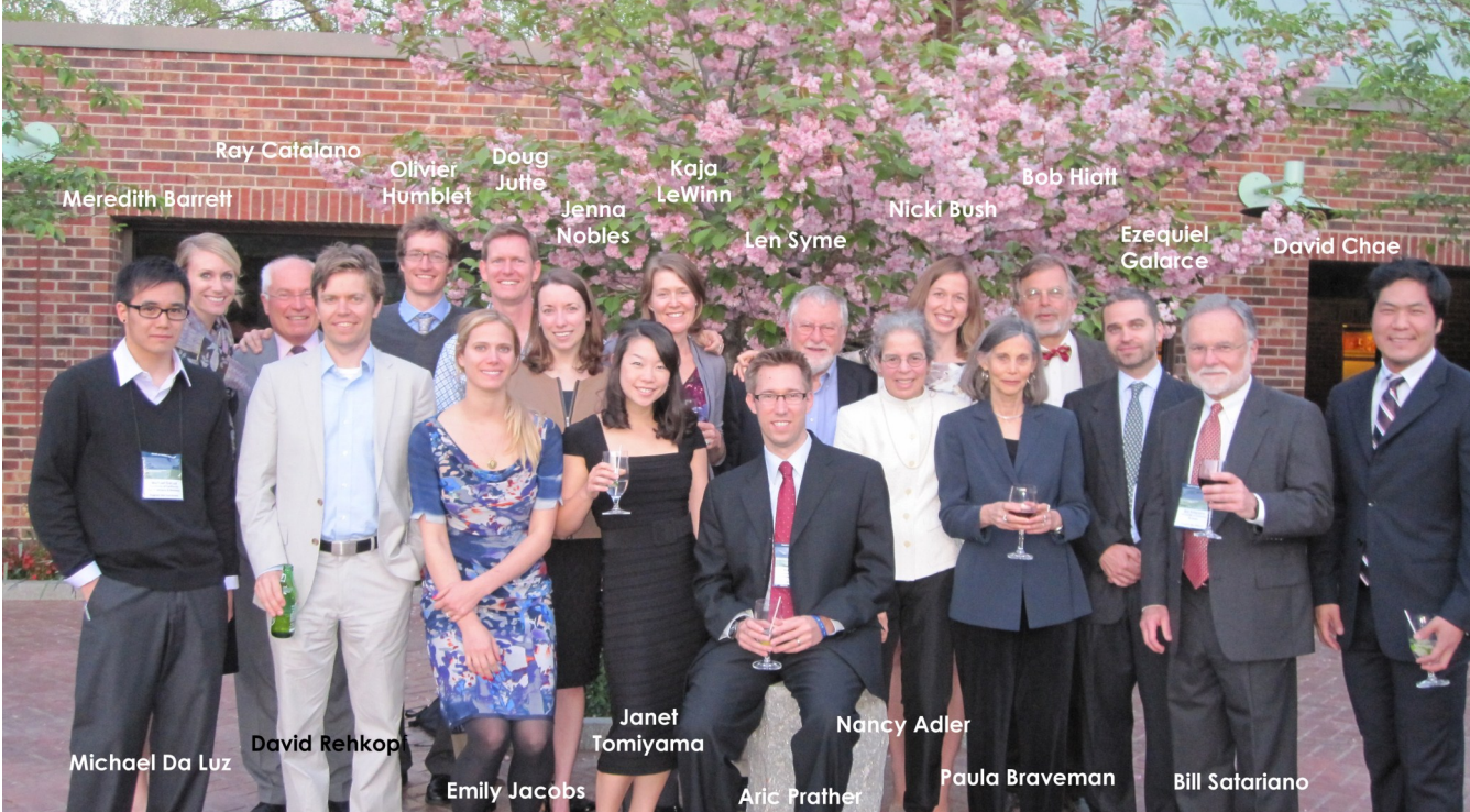
UCSF-UCB site ~ Marriott Hotel, Princeton, NJ – April 20, 2012

The Robert Wood Johnson Foundation Health & Society Scholars 10 th Anniversary Program Meeting was held April 18-21, 2012 in Princeton, NJ. The annual meeting is a wonderful opportunity to bring the scholars of the program together with the National Advisory Committee members, training site directors and faculty, RWJF staff, and esteemed guests. The meeting also serves as an introduction of the newly selected tenth cohort who attended the event as part of their orientation.