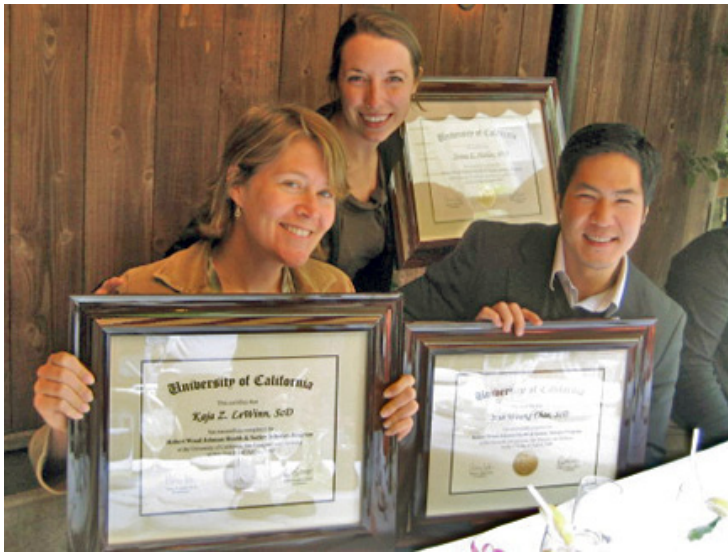
Recent Graduation Luncheon

Best wishes to our Cohort 5 RWJ Health & Society Scholars!