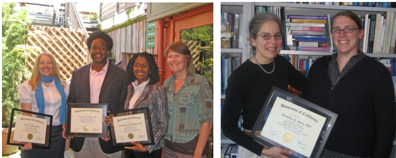
Recent Graduation Luncheon